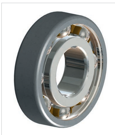
Ceramic coated insulated bearing.

A 100 µm layer ensures insulation up to 1,000 V. The shaft and housing tolerances need not be adjusted compared to non-coated bearings because the ceramic layer thickness is considered in the design.